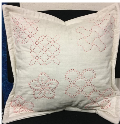
Sashiko Cushion - May

Facebook: www.facebook.com/PaulinesPatchwork